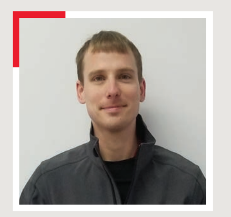
MIDWEST ALARM SERVICES